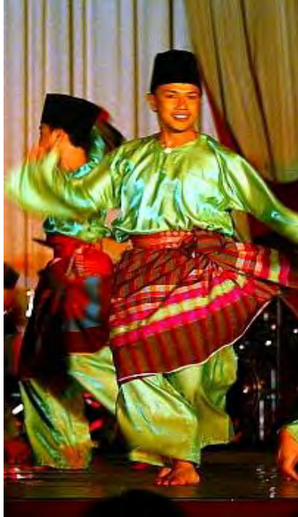
Performing Arts Group – Zapin Dance