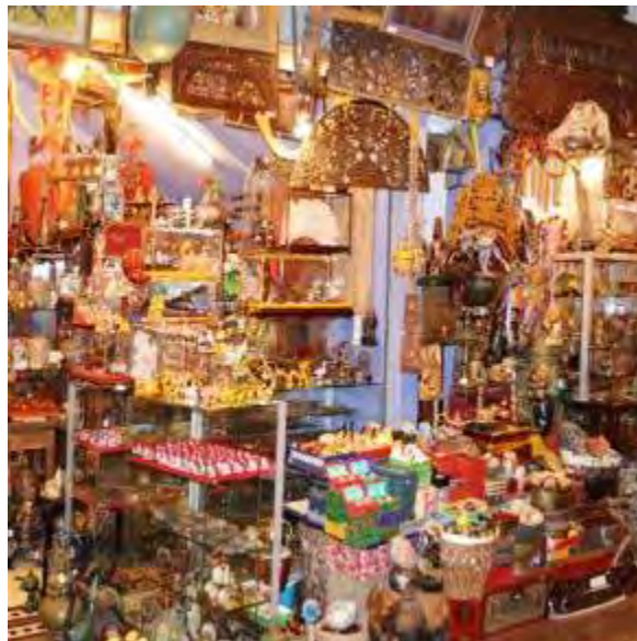
Top: Souvenirs shop Bottom: Portrait painting