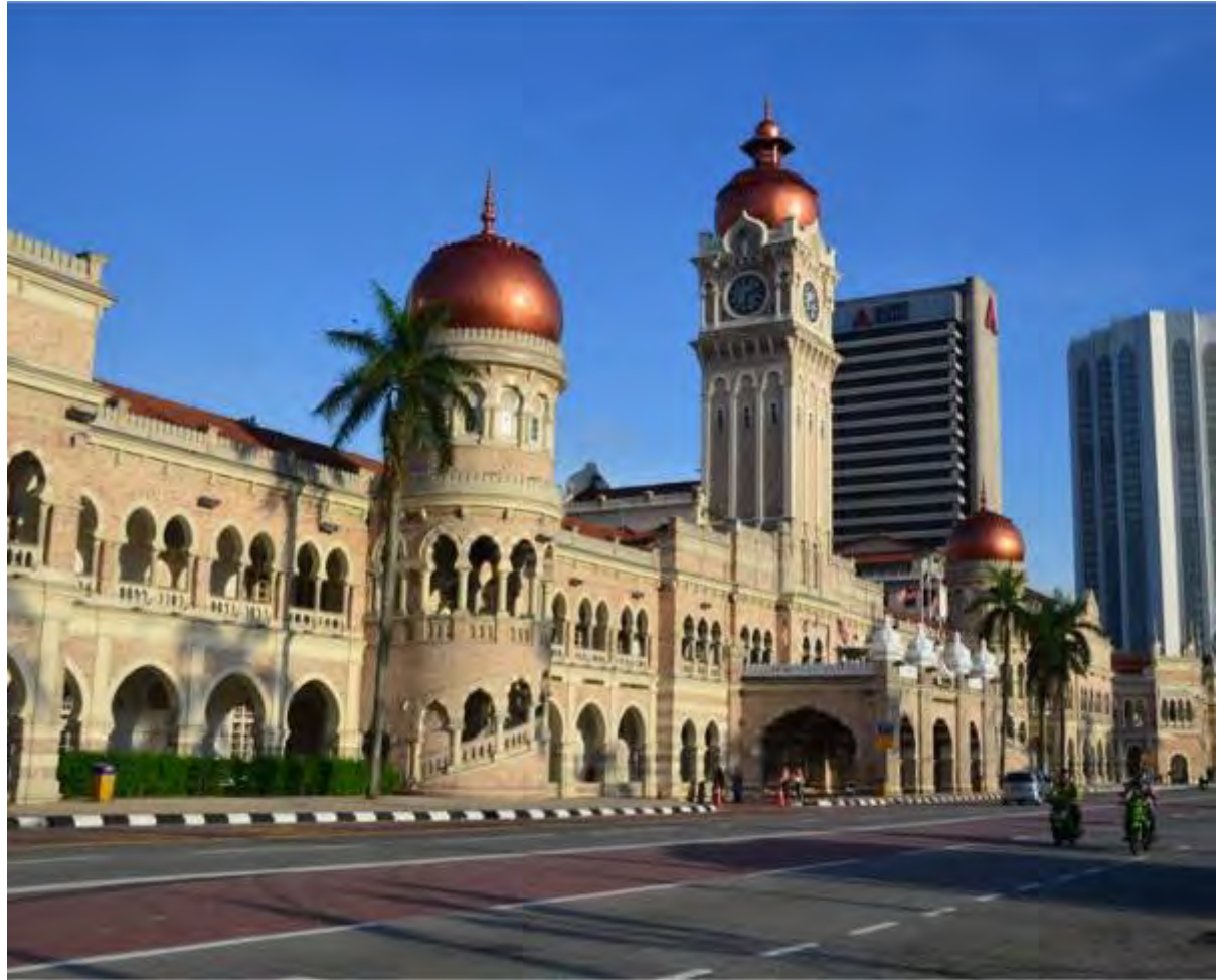
Pic: Sultan Abdul Samad Building