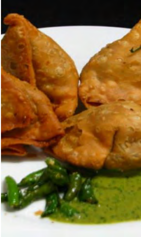
Indian Snack Samosa Tip: Try Value Bazar's Samosa