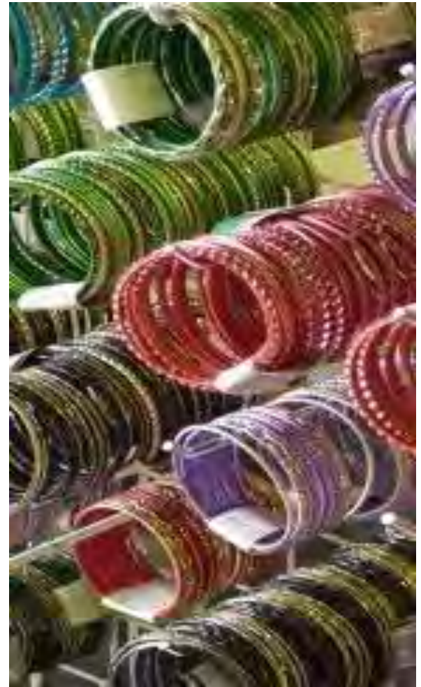
Indian Jewelry, Choorian Tip: Madras Jewelry Shop, Brickfields