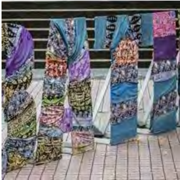
Top: Batik at Central Market Bottom: Cultural Shopping