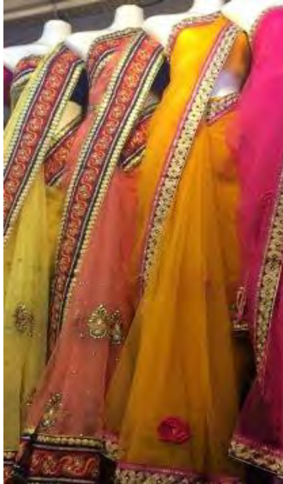
Indian Famous Dress, Saree Tip: Saree Heaven Shop, Little India